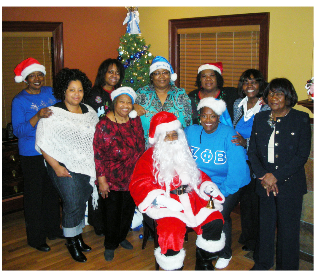
Members of Zeta Phi Beta take a break with Santa